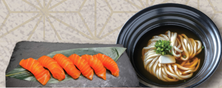
comes with REGULAR SIZE of udon (kake) SALMON LOVER 19 6 pc of salmon nigiri