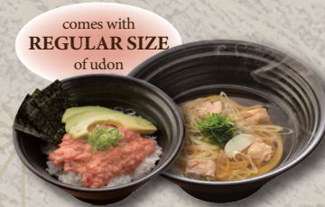
comes with REGULAR SIZE of udon MINI SPICY TUNA DON 18