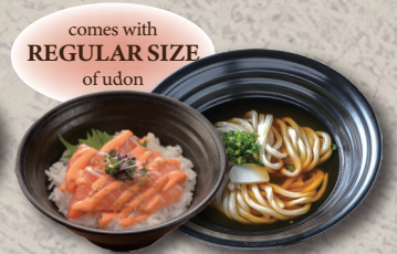
comes with REGULAR SIZE of udon MINI SPICY SALMON DON 18