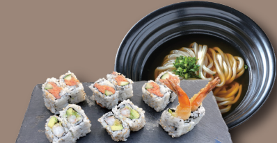
comes with REGULAR SIZE of udon (kake) 2 ROLL COMBO 21