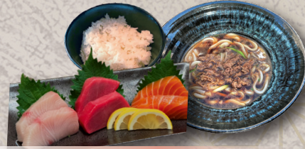
comes with REGULAR SIZE of udon (kake) LUNCH SASHIMI SET 19 tuna, salmon and yellowtail sashimi comes with udon and rice