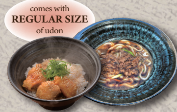
comes with REGULAR SIZE of udon MINI TATSUTA DON 15