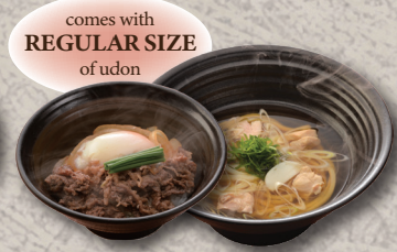
comes with REGULAR SIZE of udon MINI LUNCH SUKIYAKI DON 18