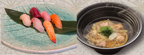
comes with REGULAR SIZE of udon (kake) PREMIUM 6 NIGIRI SET 21 toro, tuna, salmon, yellowtail, white fish, and Ebi shrimp