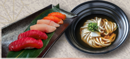
comes with REGULAR SIZE of udon (kake) TRI COLOR NIGIRI 21 2 pieces of tuna, salmon and hamachi